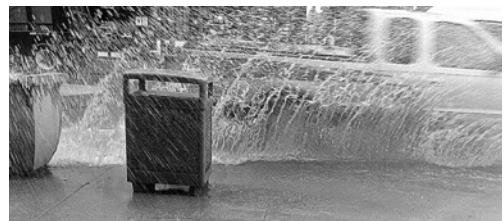
Above right Name: Claudia Banahan Where: N. Broadway & Short Streets, Lexington Camera: Apple iPad Mini Lens: NA Shutter: NA f/stop: NA ISO: NA