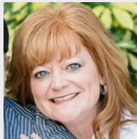
photo industry, having seen the rise and fall of film and the birth of digital photography, as well as having developed software for print labs, professional output and processing equipment. With all that knowledge and experience, she manages to share the joy of photography through humor, emotional connection and fun! Come live, laugh and learn with Fuji's favorite Technology Tamer.